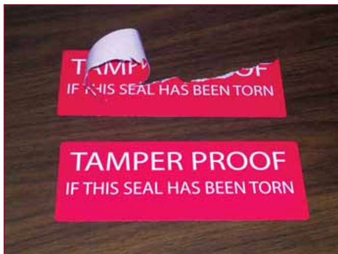
Tamperproof cuts on semi-gloss paper

Destructible vinyl does just what the name implies. After the material is applied to the surface and the adhesive has had time to set up, the label becomes destructible. If you were to try to pull the label up, it breaks into pieces and you can not get the label off the product as an entire label. This is very effective for warning labels, parking meter labels and other applications where you do not want the label removed.